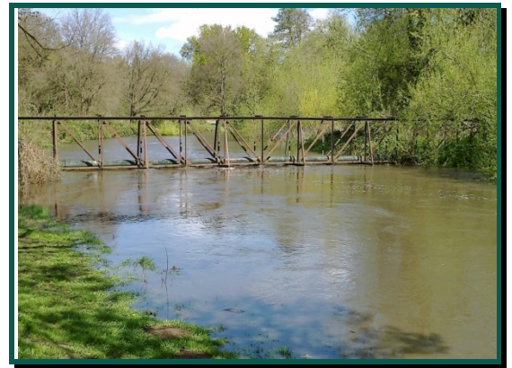
Brilliant photos of the river by Kevin Gregory HN55 showing the difference in water levels pre & post the torrential rain